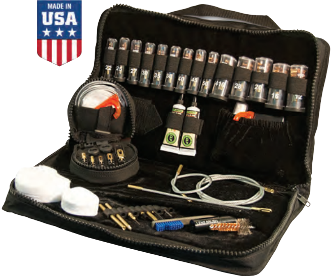
THE OTIS ELITE CLEANING KIT FG-1000