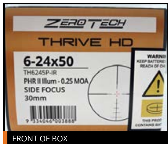
FRONT OF BOX

Further information is accessible via the following links.